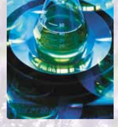
Modern fragrance compositions usually contain both natural and synthetic raw materials and ingredients.

In addition, fantasy bases can lend a unique, special nuance to a composition.