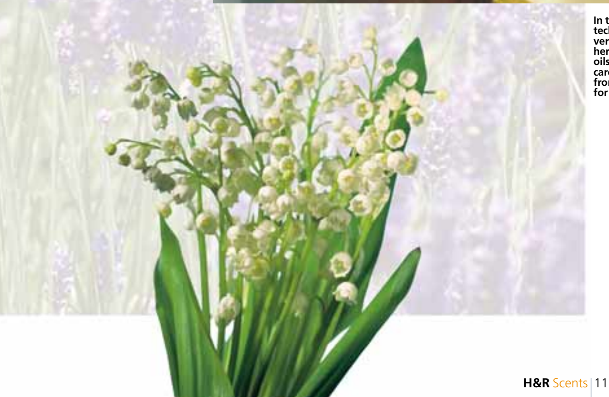
In the headspace technology version shown here, fragrance oils are very carefully removed from the plant for analysis.